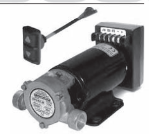
SPO-RR Reversing Vane Pump Remote Location Control

Concept: GROCO vane pumps are positive displacement pumps, capable of operation in either direction. They may be used to perform a variety of on-board duties such as fuel transfer, engine oil change or ballast trim (DO NOT USE FOR GASOLINE or other combustible fluids).