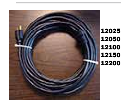
Power Cords Gauge Voltage C 12025 16/3 115/230

Zinc Anode - sacraficial; ½" dia; fits all models