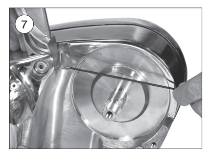
Replace grub screw using fastening compound.

(8) Replace gypsy, drive pins and clutch nut, tighten using clutch nut spanner.