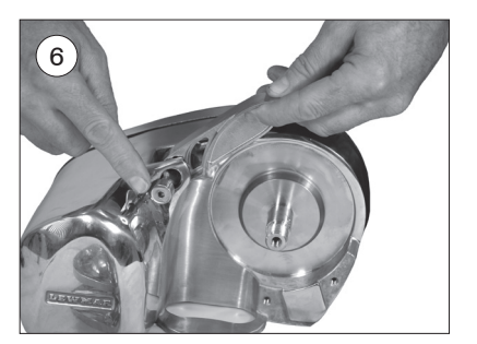
Replace pin by using the 4 mm (5/32") Allen key, push and rotate pin anticlockwise. The pin should then spring out and locate.