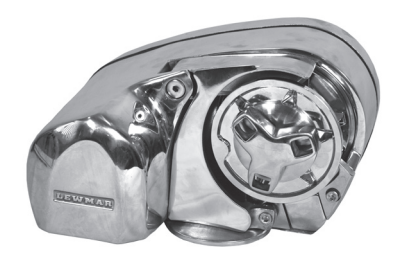
The new rope guard and control arm kit is fitted