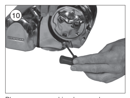
Place rope guard in place and secure using M6 x 20 screw and fastening compound.

NOTE: Spacer not required on Pro-Fish models