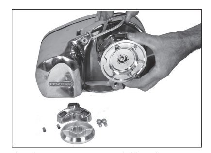
Remove gypsy, cone and drive pins using clutch nut spanner and Allen key for the stripper screws.