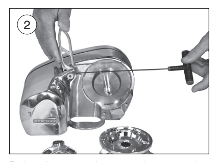
Raise the control arm and remove the grub screw located at the base of the arm using the 2mm (5/64") Allen key. This is fixed with loctite, gentle heat will aid removal.