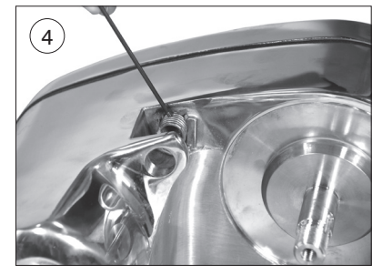
Fit new torsion spring