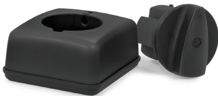
Battery and Charging Station