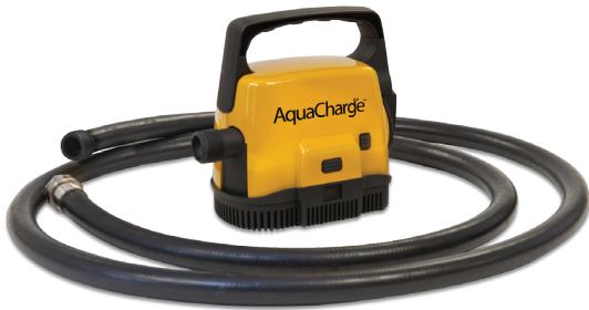
Submersible Pump and 8' Hose