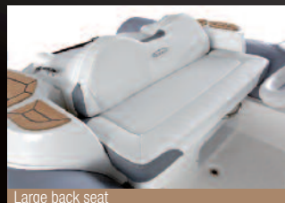
Large back seat