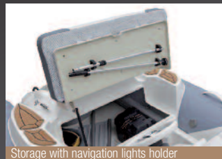
Storage with navigation lights holder