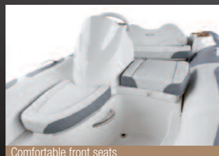
Comfortable front seats