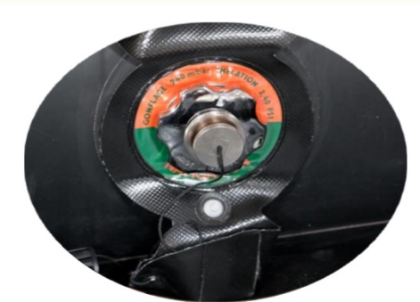
Intercommunication / Inflation Valves