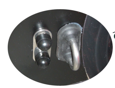
Lifting and Towing Points