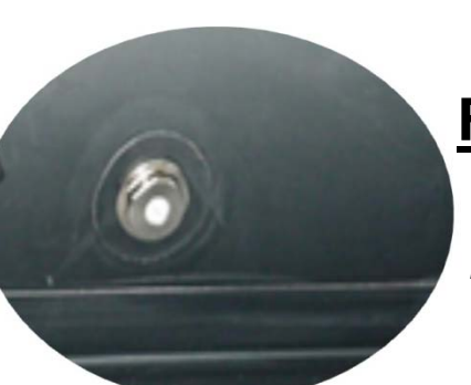
Fast Inflation Points