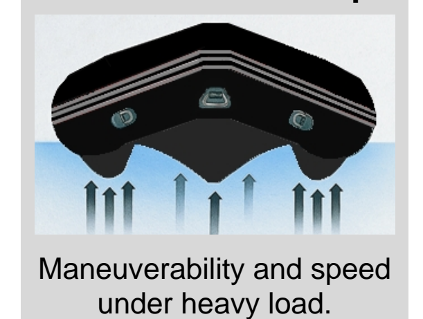
FUTURA™ Hull Shape