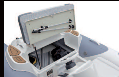
Storage with navigation lights holder

A natural complement to any yacht, the Zodiac® YACHTLINE range has been revisited to better satisfy your needs and to better fit your boat.