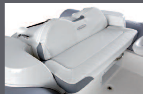
Large back seat