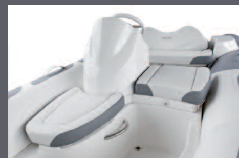
Comfortable front seats