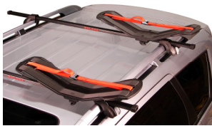
Item # MPG107M

Purchase a Malone "Autoloader" or "SeaWing" Car Rack and Receive a $15 Factory Rebate