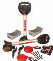
Item # MPG201, MPG202

Purchase a Malone load assist package "Telos" or "StaxPro" Car Rack and Receive a $15 Factory Rebate