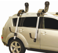
Item # MPG351

Purchase a Malone "Autoloader" or "SeaWing" Car Rack and Receive a $15 Factory Rebate