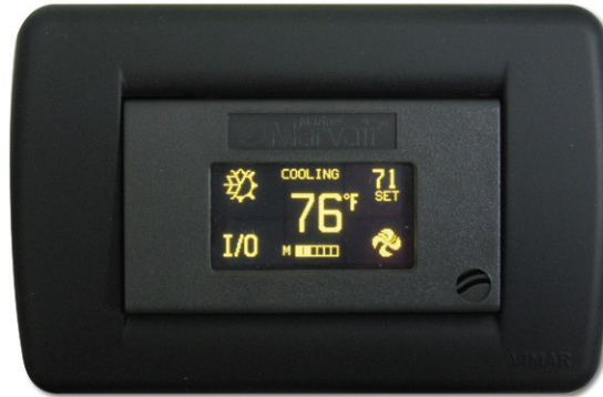
Display with Black Rondó Polymer Cover Plate

The o-TOUCH is a digital display/controller that provides touch screen control of temperature and humidity control, six fan speeds and shows fault conditions in a compact, yet easily readable display. The o-TOUCH display/controller is designed to operate with Marvair® self contained models and split systems models. The o-TOUCH display/controller (using an Organic Light Emitting Diode display) is the latest in display technology with features not available in other, less advanced systems. OLED (Organic Light Emitting Diode) displays are brighter, thinner, lighter and use less power than older LCDs. In addition, OLED's offer wider viewing angles and higher contrast than LCDs.