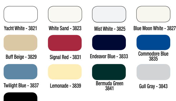
Black Ice - 3845

EZ-Poxy² is a high-performance, two-part polyurethane marine paint without all of the costs and hassles associated with two-part enamels. EZ-Poxy² combines the added gloss, wear resistance, and durability boaters are looking for in a two-part polyurethane enamel with the ease of application of a single part product. This revolutionary formula reduces the effects of brush strokes and is so forgiving; it's practically fool-proof. In fact, EZ-Poxy² is so innovative that it makes exact mixing ratios a thing of the past. Its added UV protection and gloss retention will keep your boat looking shiny and new for years to come. It is more economical, requires less effort, and is more forgiving than the competition.