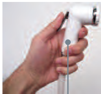
Save water on board – one touch trigger handset to conserve water during showering