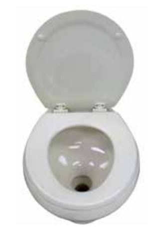
Residential-style seat and bowl of the MasterFlush 7100 series is the largest among basic macerator toilets.