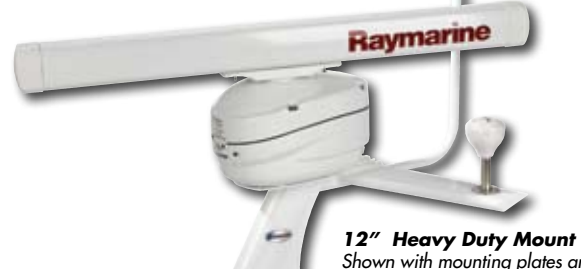
12" Heavy Duty Mount Shown with mounting plates and optional Antenna Mounting Wing, Antenna Extension, Light Arm, Anchor Light and GPS Mount.