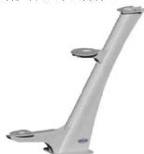
#6830 for Radar Dome/Sat Dome