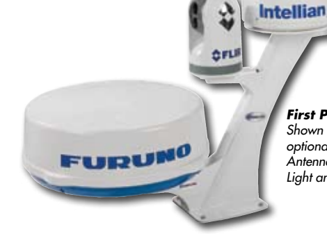
First Production Triple Mount! Shown with mounting plates and optional Antenna Mounting Wing, Antenna Extension, Light Arm, Anchor Light and GPS Mount.