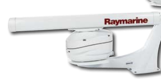
Dual Mount Shown with mounting plates and Light Arm and Anchor Light.