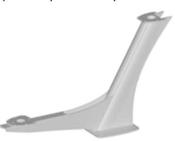
24" - #6825 for 4' Open Array/Sat Dome