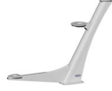
#6835 for 4' Open Array/Sat Dome