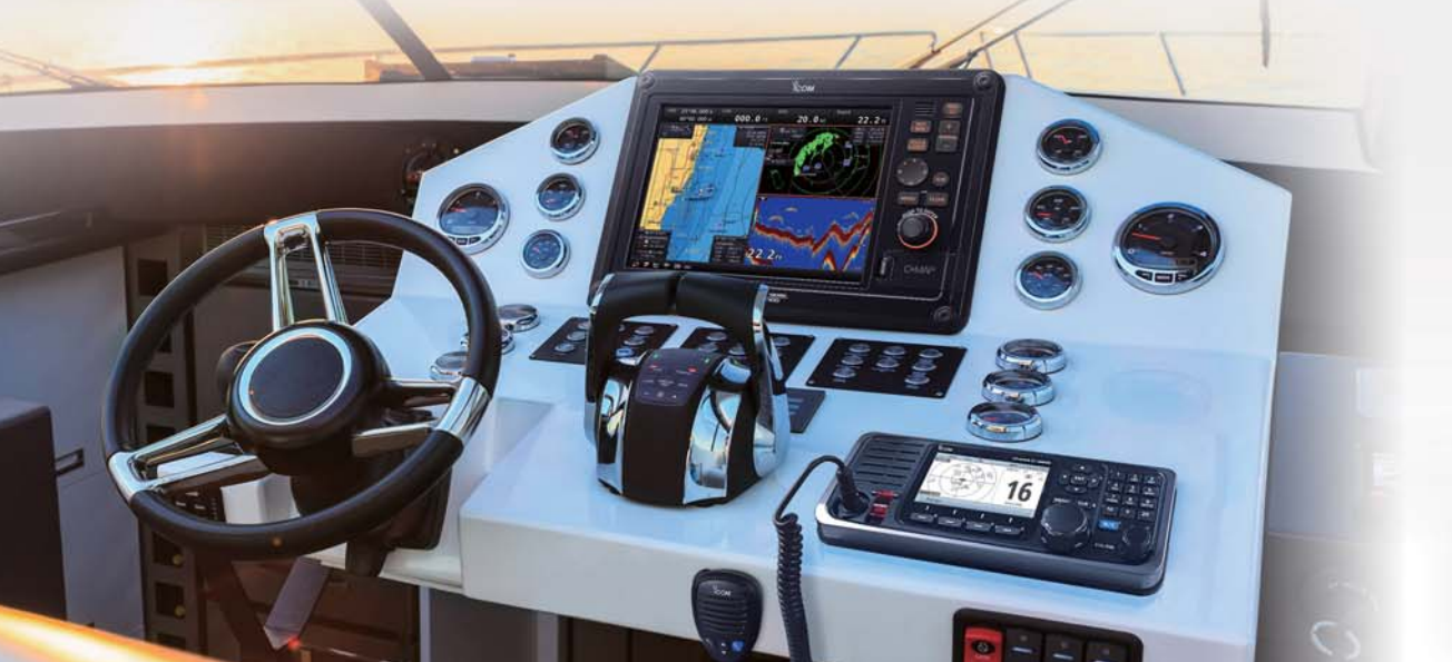
AIS target list