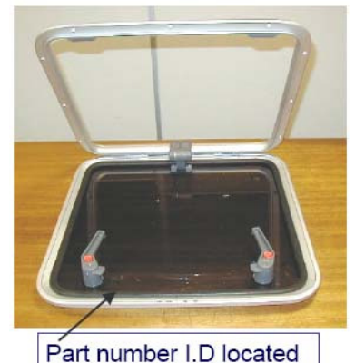
Part number I.D located here.

Non-standard sizes hatches may not follow this pattern