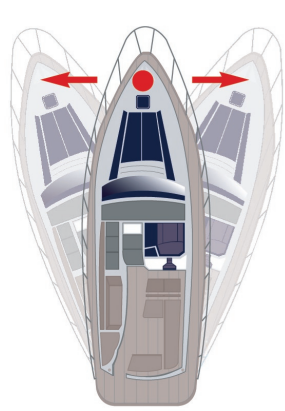
Bow thruster alone