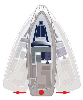
Stern thruster alone