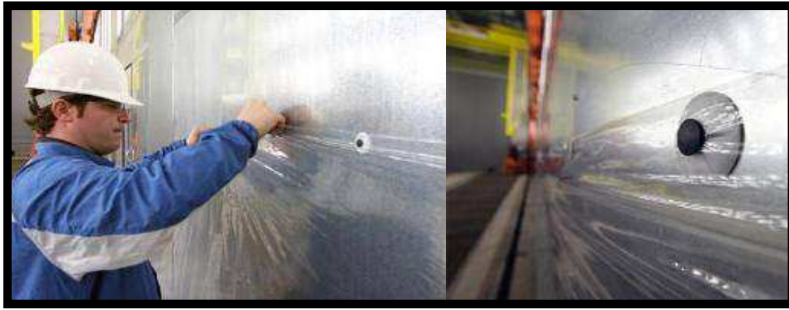
Used to hold liners in automotive paint room booths