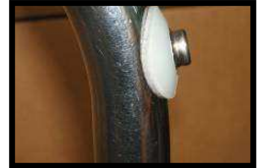
Flexible base perfect for curved surfaces