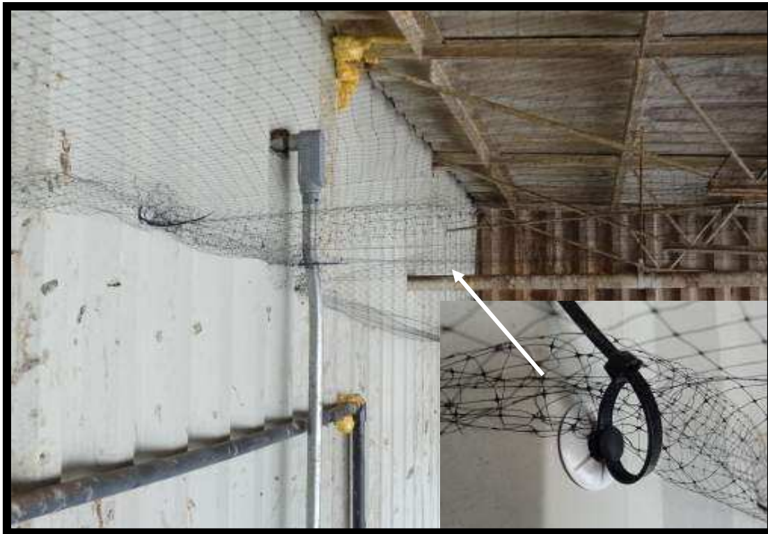
Used for bird netting