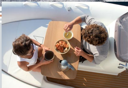
Table system towards the bow for a "dining area"