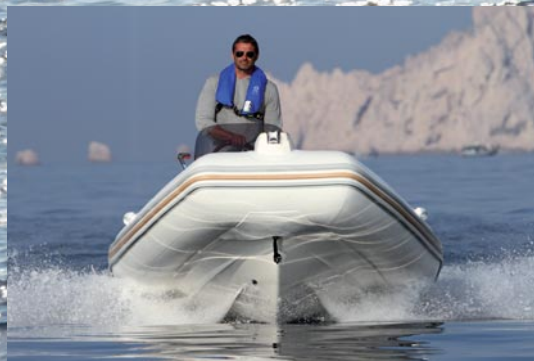
New hull, new deck, new tube