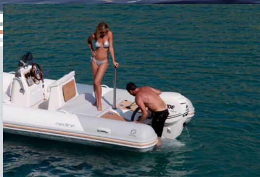
Aft bathing platform to ensure safe re-boarding