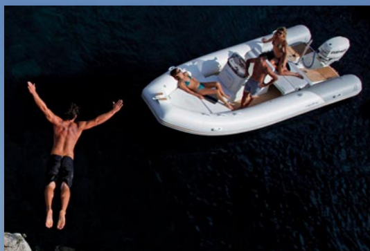
Clever convertible stern bench for an extra sundeck