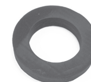
4. Foam seal 24-0142 quantity-1