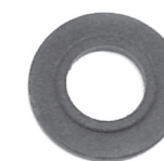
9. 3/8" shoulder washers 14-0336 quantity-8