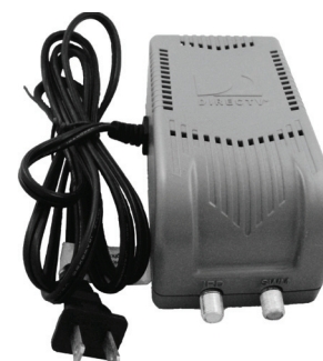
15. Power inserter, SWM 19-0615 quantity-1