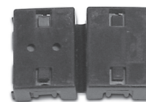
6. Core clamp (ferrite) 29-0037-02 quantity-1