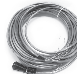
12. Data cable- 100 ft (30.5 m) 32-0619-0100 quantity-1