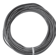
14. Ground wire- 25 ft (7.6 m) 32-0949-25 quantity-1