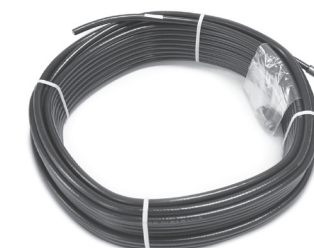
13. RG-11 RF cable- 100 ft (30.5 m) 32-0566-0100 quantity-1