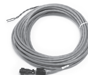
11. Power cable- 100 ft (30.5 m) 32-0510-0100 quantity-1