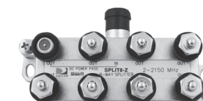
16. 8-way splitter, SWM 19-0618 quantity-1