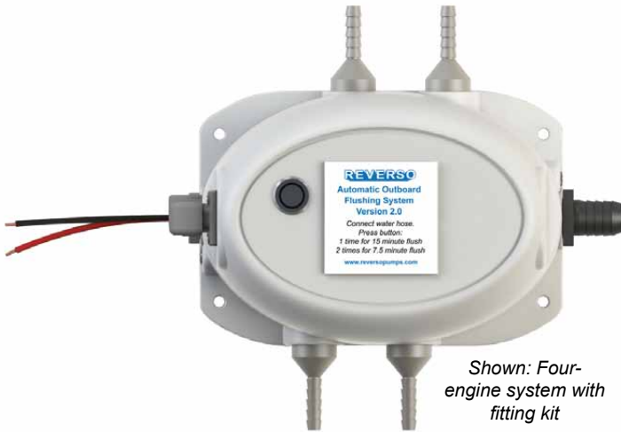
Shown: Four-engine system with fitting kit