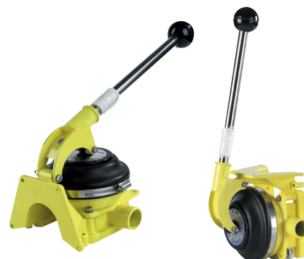
Gusher 10 Mk3 Standard BP3708

For details of our bulk pack range for boat builders and wholesalers - contact Whale Support.