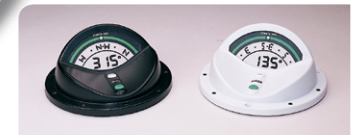
Award-winning flushmount design , available in black or white.

Push-button off-course indicator changes upper display from rotating compass rose to off-course steering indicator.