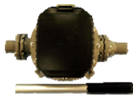
Top view of closed Trim Ring and Removable Handle