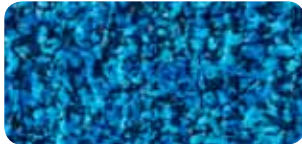
Dark Blue 32398000